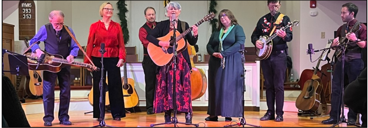
Once again, we had CINE (Christmas in New England) move us into the spirit of Christmas.