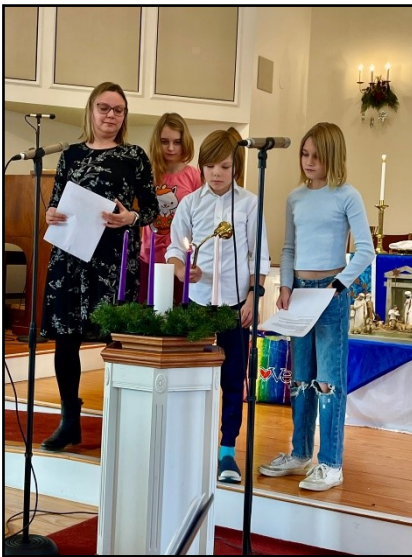
Family lighting the candles on the Advent wreath.