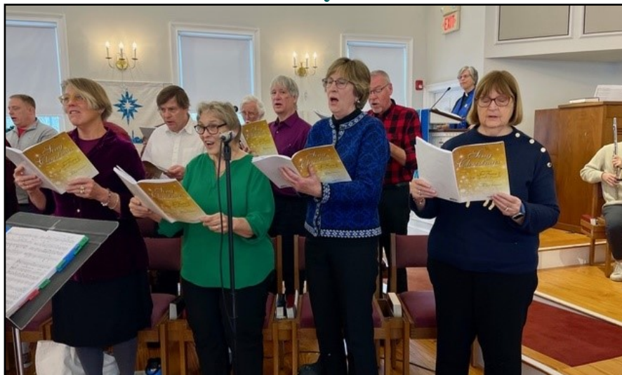
The Christmas Cantata held on Sunday, December 14th was mesmerizing! In addition to musicians and the Berlin Church Choir, the children sang, plus a quartet, and a duet.