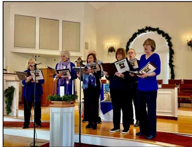
Sounds of Peace sang beautiful music.