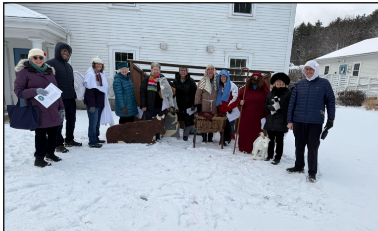
About 10 of us joined to share the Christmas Story on a very cold Sunday.