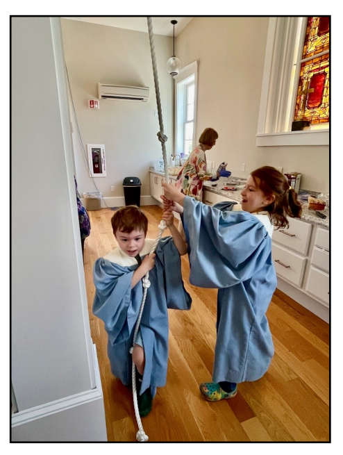
Brother and sister are having fun ringing the bell.