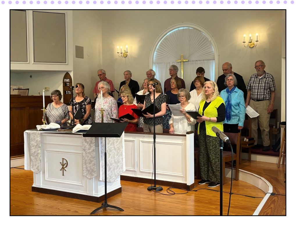
Once again, our choir combined with the Berlin Parish choir which equaled wonderful music! Picture above is from May 4.