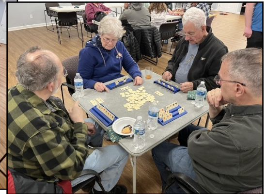
People of all ages gathered for a fun night of food, games, and music to ring in a new year.