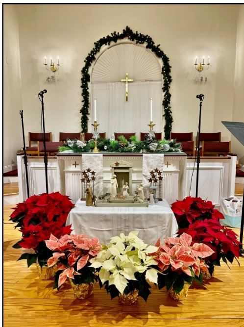
Silent Night sung by candlelight