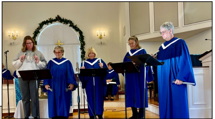
Our bell choir: the Ding-a-Rings

The senior choir, the children, and the Ding-a-Rings performed Christmas in the Valley on Sunday, Dec. 15th. That same day, many volunteers joined the choir and sang Halleluiah .