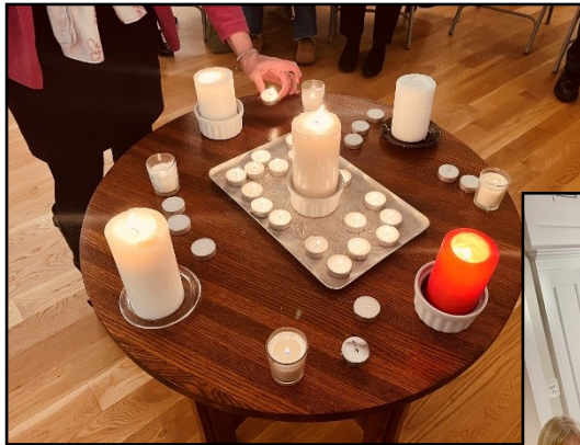
Sounds of Peace bless us with beautiful music