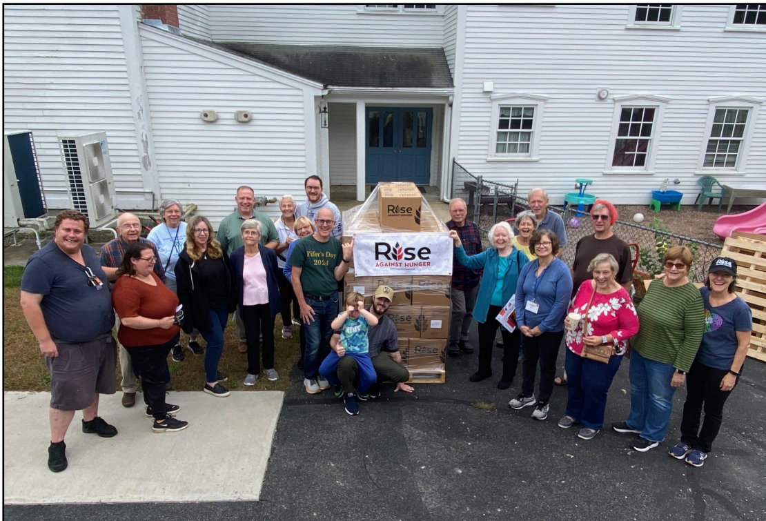
This is only about half of the group that made meals on Sunday. If you go to page 9 you can read the account.