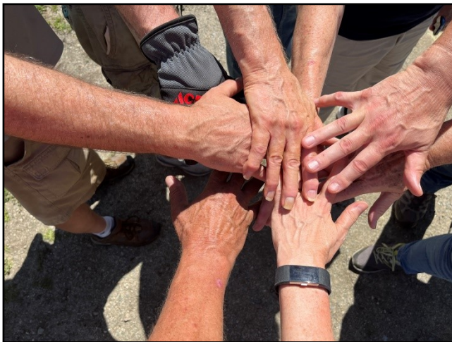
It takes many hands!