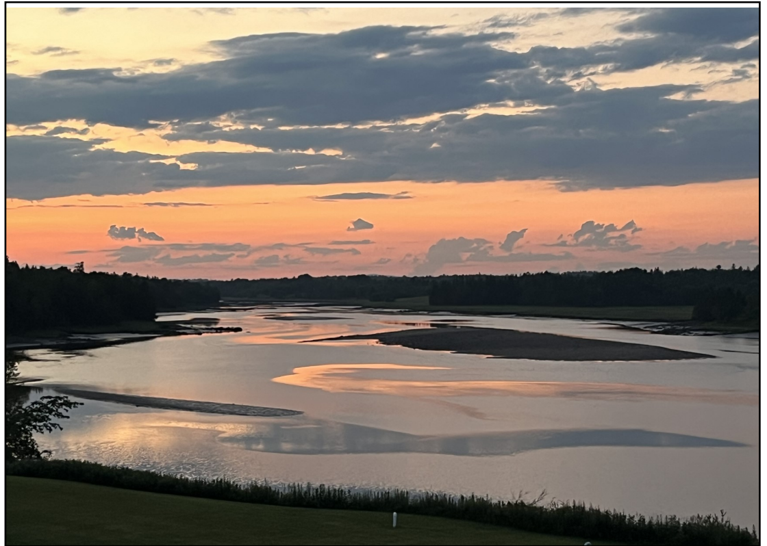
Narraguagus Bay near Cherryfield, ME. See pages 4 & 5 for the scoop on the Adult Mission trip.